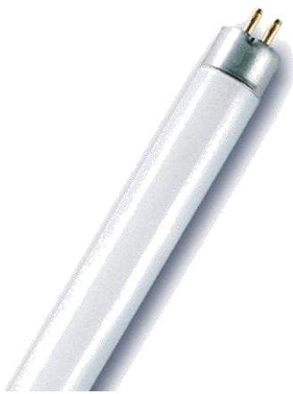
LUMILUX® T5 HE