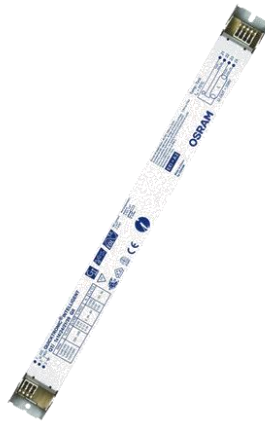
QTi DALI/DIM / QTi GII / QTP5