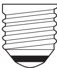
E27 IEC 7004-21