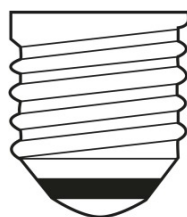
E27 IEC 7004-21