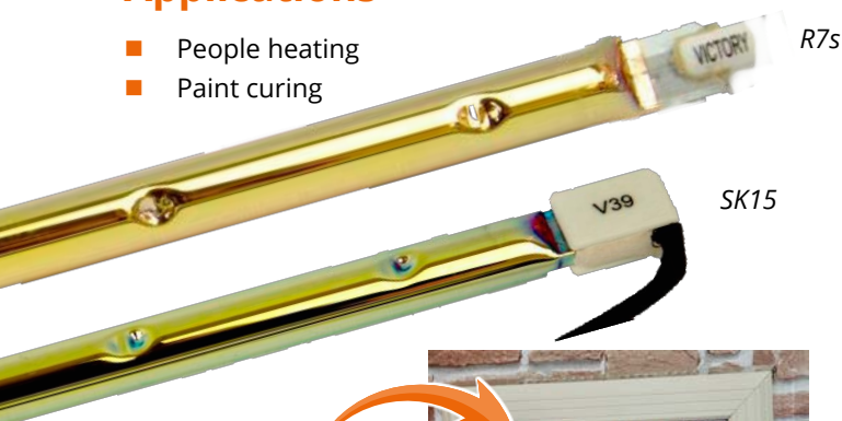
Low Glare Gold lamp