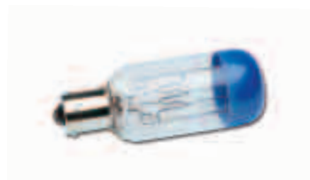
FWT 240V 1200W