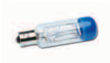
240V 150W BA