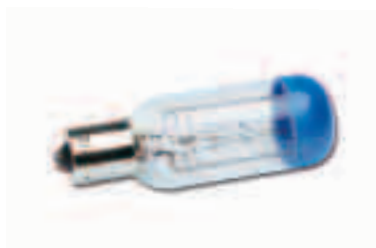
240V 100W BA1