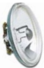
PAR36 6V 30W