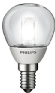
Novallu. E14 P45 CL