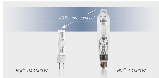
A direct comparison between an HQI®-T 1000 W with an E40 screw base and an HQI®-TM 1000 W with a G22 plug-in base clearly shows the difference in size.