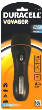
Art 11500 CL-10 5xLED 2D 20 Lumen 20mtr