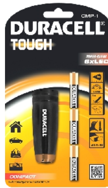
Art 11505 CMP-1 6xLED 3AAA 37 Lumen 10mtr