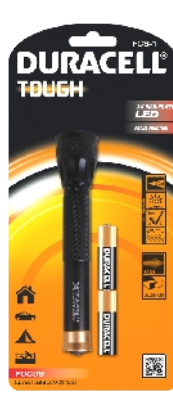
Art 11503 FCS-1 LED 2AA 127 Lumen 117mtr