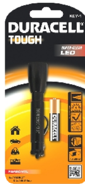
Art 11508 KEY-1 LED 1AAA 6 Lumen 27mtr