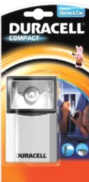
Art 68454 COMPACT-45 Krypton bulb 1 x 3R12 4,5V