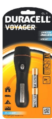
Art 11499 CL-1 LED 2AA 22 Lumen 40mtr