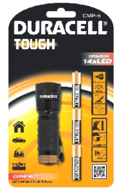
Art 11507 CMP-5 14xLED 3AAA 63 Lumen 18mtr