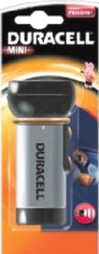
Art 69555 MINI Krypton bulb 2AA