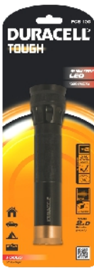
Art 11504 FCS-100 LED 2D 160 Lumen 209mtr