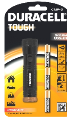
Art 11506 CMP-3 9xLED 3AAA 44 Lumen 12mtr