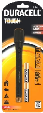
Art 11501 SLD-1 LED 2AA 131 Lumen 120mtr