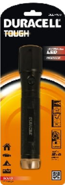
Art 11502 SLD-100 LED 2D 145 Lumen 177mtr