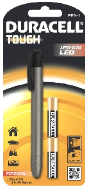
Art 11509 PEN-1 2AAA LED