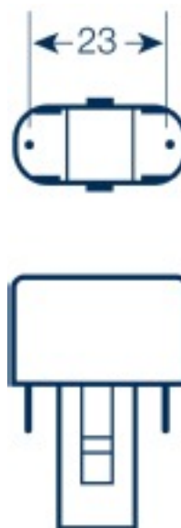
Product line drawing