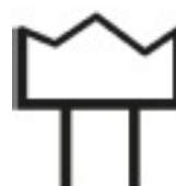
Product line drawing with letters